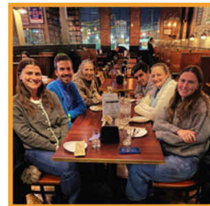
ASSOCIATE BOARD MEMBERS AND PROJECT MORRY STAFF AFTER THE TELETHON