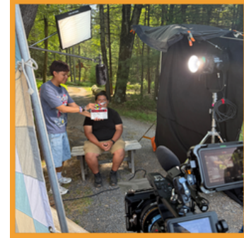
FILMING AT MORRY'S CAMP THROUGH THE GLORIA KAPLOW ARTS AND CREATIVITY PROGRAM

Thank you to Taco Bell Foundation, United Way of Westchester and Putnam, Westport Weston Family YMCA Bedford Family Social Responsibility Fund, and 100+ Women Who Care for their support of our work and students!