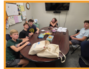
SUPPORT SUNDAY YOUTH AT PROJECT MORRY OFFICE