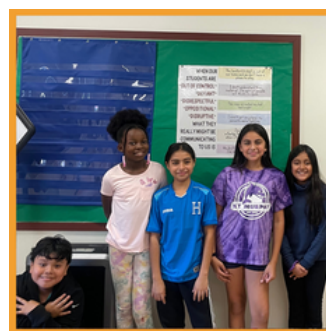
UNDER GRAD STUDENTS FROM STAMFORD AT NOVEMBER SCHOOL YEAR MEETING

We hosted a virtual symposium in December called "Strategizing For More Equity In Our Educational Environments." 25 people, including Project Morry staff, school social workers and principals, and Connecticut nonprofit employees and foundation partners, gathered to learn, discuss, and strategize around this crucial topic. The first of a series, we are so grateful for everyone's participation, and look forward to the next one!