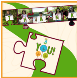
2025 YEAR-END APPEAL