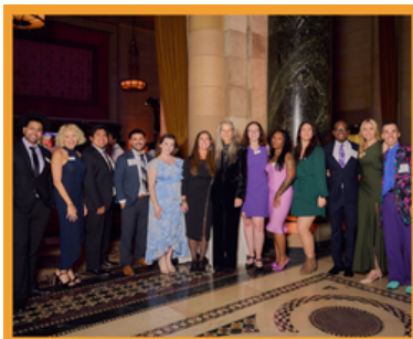
PROJECT MORRY STAFF AT 2025 ANNUAL BENEFIT