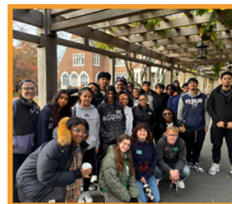
POST GRAD STUDENTS AT SARAH LAWRENCE COLLEGE